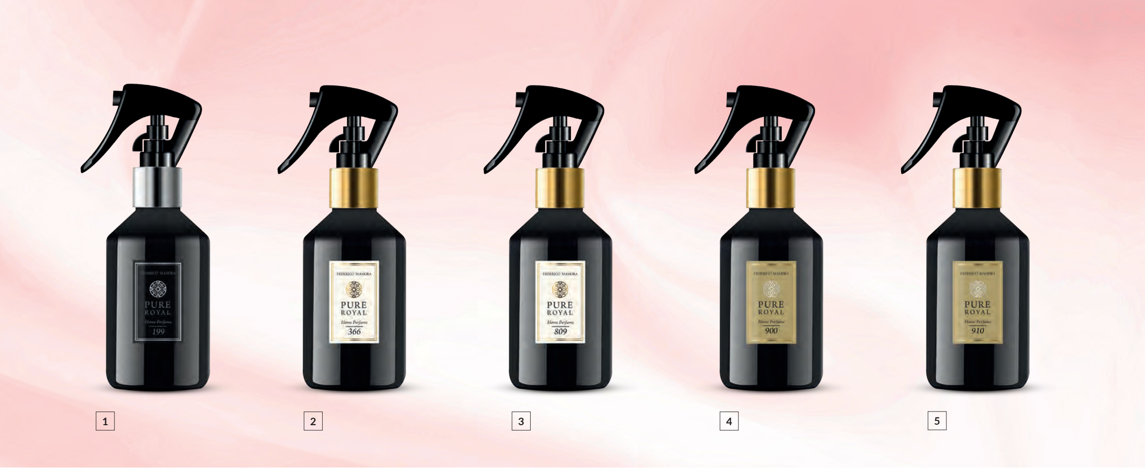
1 PURE ROYAL HOMME 199 720199 |